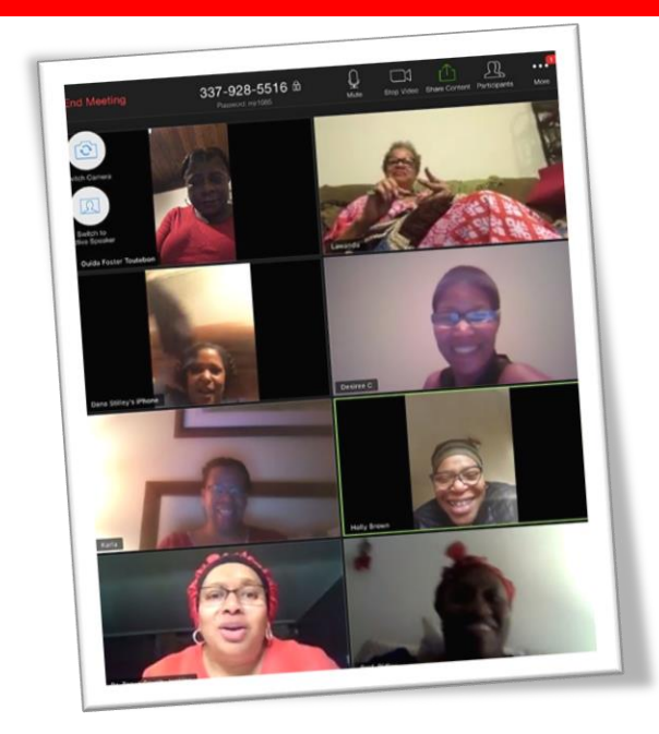
PJ's and Pizazz!

A few sorors gathered last month for a virtual Pajama Party. Yes, it was a 'real' party and included a 'scary' story! Well maybe not so scary but fun!